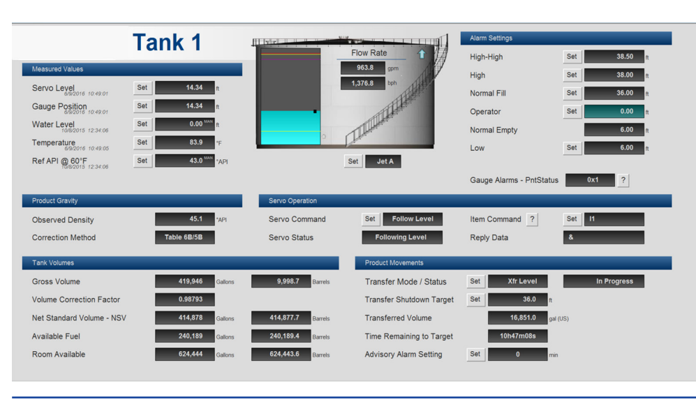
Figure 3. Illustration of tank detail screen with inventory management and movement tracking.

As operators provided more details, they described the issue with reported levels lower than what the pipeline receipts indicated was received. These were showing up as losses for their receipt reporting. They also occasionally saw level changes in tanks that did not have receipts or issues during the closeout period. More interesting was the fact that when reconciliation was completed across the tank farm, the data did not indicate a loss at the site level. This left operators confused as to how they could have all of these variables happening and still be within tolerance once they ran site-wide inventory closeout reports.