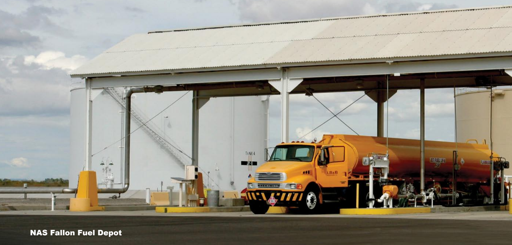
NAS Fallon Fuel Depot

The Fuels Division handles as many as 200 aircraft fueling requests per day during peak operations, so maintaining inventory control, reconciling all fuel movements, receipts and issues, can be critical to success. Fueling transactions, which can total over $60 million annually, need to be properly documented, processed and billed correctly to the customer.