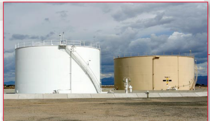
The day-to-day fuel storage, handling operations and maintenance is outsourced to a commercial company, LB&B Associates, Inc., under the oversight of the NAS Fallon Fuels Director and staff.